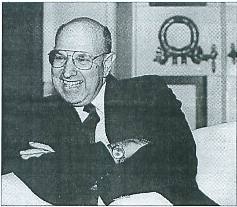
Thomas Pickering, who is investigating accusations of rudeness by consular employees.